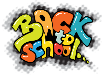
6 th Grade Clap-in

We kicked off the 1 st day of school with our annual Clap-in! Students and teachers entered the building through a human tunnel made by our 6 th graders. It was so great being together with everyone again!