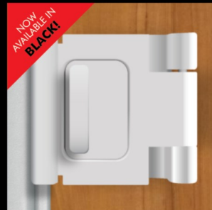
Door Guardian Outswing