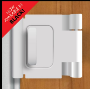
Door Guardian Inswing